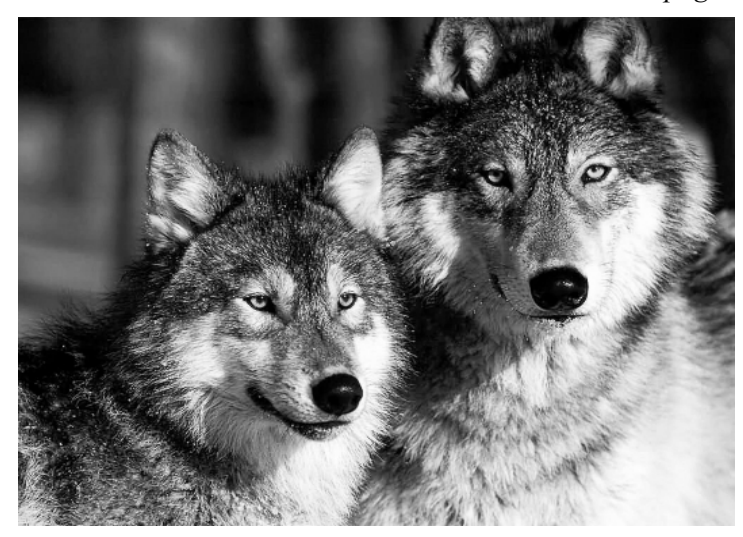
To see firsthand the importance of wolves to ecosystem health watch this short film: <a href="http://www.filmsforaction.org/watch/how-wolves-change-rivers/">http://www.filmsforaction.org/watch/how-wolves-change-rivers/</a>