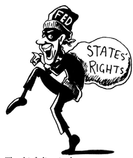
The thief disguised as government

Our federal and state public lands are a boom to our local economies, attracting investment, tourism and attracting locals who have lived and invested their lives in this community to retire here with the wealth earned during their entire working lives. Privitization of public lands would lead to "Keep Out" signs on what is now open to all citizens and it would create economic hardship in rural counties.