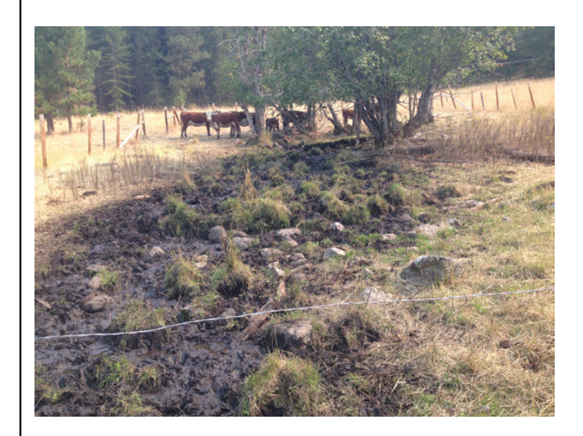
Diamond M cows inside an exclosure meant to the protect a spring that seasonally feeds into the upper San Poil River --Copper-Mires Allotment, Kettle Range - August 2017--

Livestock operations produced about three-tenths of one percent of jobs in Ferry, Stevens and Pend Oreille counties in 2015. The Colville National Forest reported it spent $25,455 in 2016 and $38,926 in 2017 to repair livestock grazing infrastructure (fences, water troughs), mostly performed by Forest Service employees or summer youth corps volunteers, rather than by permittees. Nationally, total congressional appropriations for the federal grazing programs in fiscal year 2014 was $143.6 million, while grazing receipts were only $18.5 million.