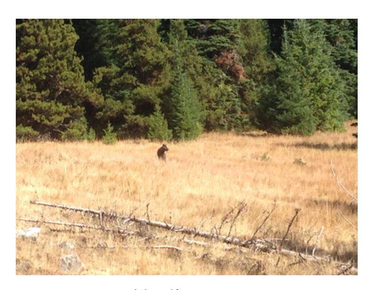
Adult wolf on Copper Butte

3) Protecting Wildlife: 1) participated in the Washington Wolf Advisory Group meetings (Jan, Feb, March, May 2017 and March 2018) advising the Dept. of Fish & Wildlife about their management of gray wolf recovery; 2) worked with Eastern Washington Wolf Coalition to create a regional wolf advocacy group dedicated to protecting wolves, and 3) Participated in filming "Profanity Peak Pack: Set up and Sold Out" produced by Predator Defense http://www.predatordefense.org/profanity/